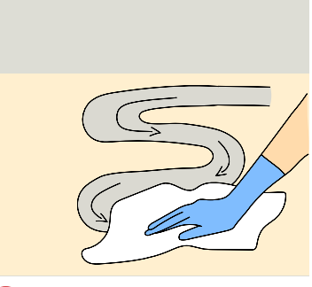
3. Wipe the surface in an S-Shape moving from clean to dirty. Use the wipe flat not scrunched.