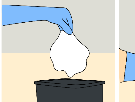
Discard used wipes in the appropriate waste bin following your local agreed guidelines.