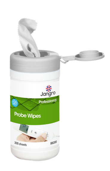
Health & Safety Please refer to relevant COSHH Safety Data Sheet