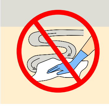
Do not go over the same area twice with the same wipe.