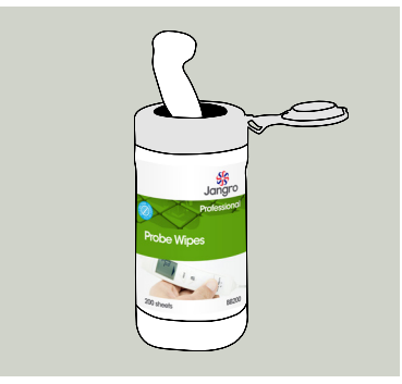
Check pack for use period and dispense a wipe.