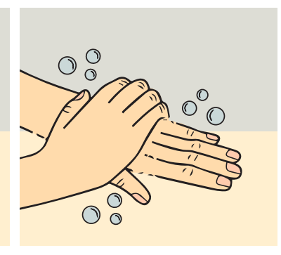
7. Wash hands thoroughly after use.