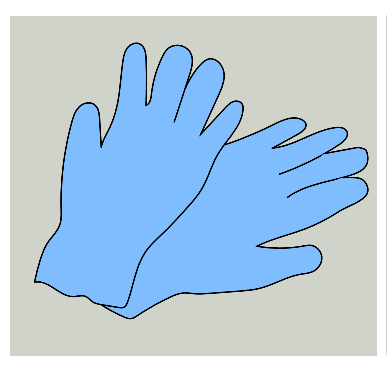
Please Use appropriate PPE as indicated in COSHH sheet.